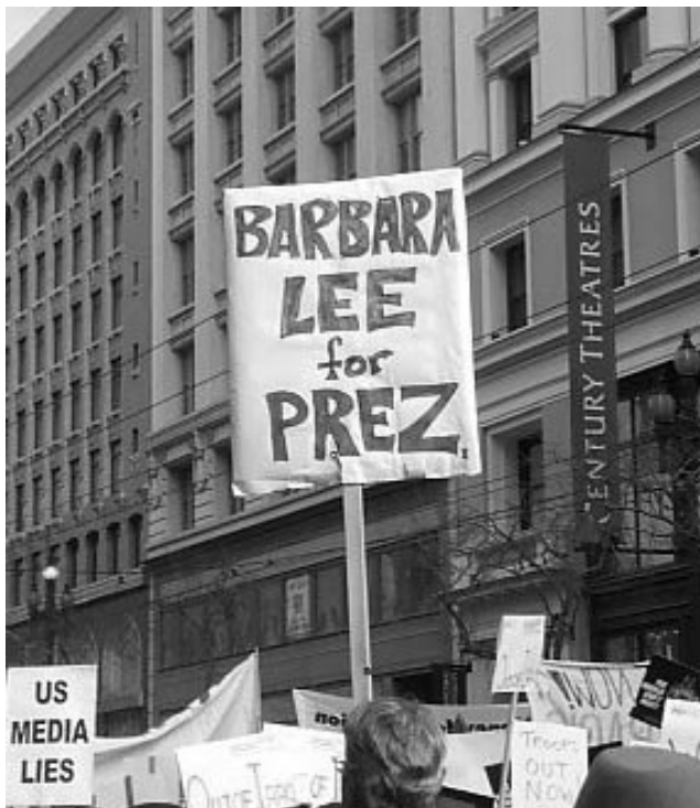
Sign at the January 27 anti-war march in SF

On March 8 Barbara Lee introduced a bill calling for a six month timeframe for withdrawal. The bill was introduced as a direct challenge to the President’s attempt to escalate the war. Nancy Pelosi is advocating a timetable for withdrawal by mid- 2008, but conservative Democrats (and Republicans) may block this effort.