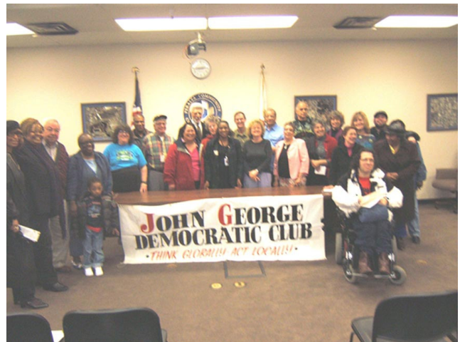
John George Democratic Club members pose with Ron Dellums after mayoral forum on April 15