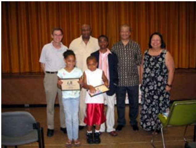
Club Members and Award winners on June 17